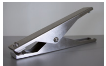
Big Clamp (BC-90-W)