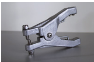
Smart Clamp (SC-41)

Approved and reliable grounding clamps are characterised by their high clamping forces, and ability to penetrate through existing insulating layers such as dirt, grease and paint. This establishes an effective metal-to-metal connection and guarantees a secure grounding. Due to the different opening widths, the grounding clamps are suitable for a broad range of applications. The respective application fields for each clamp can be found in the table on the next site.