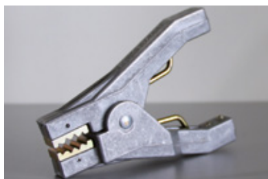
Aircraft Clamp (AC-42)