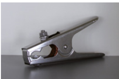
Big Clamp Cling on (BC-04-W)