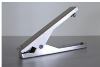
Medium Clamp (MC-45)